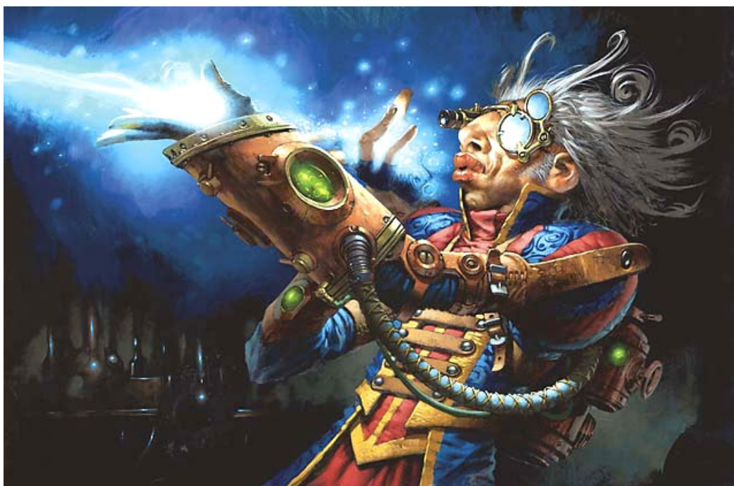
Izzet Guildmage final art by Jim Murray