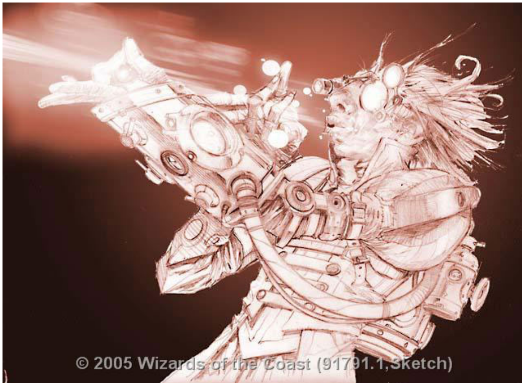
Izzet Guildmage sketch by Jim Murray